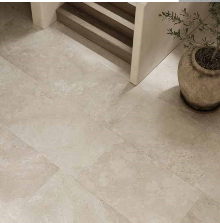
Crossland Pearl 24"x36"