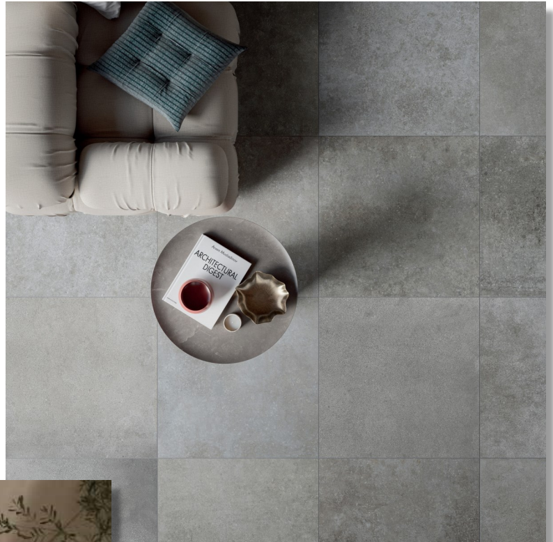
Dijon Couches 12"x12"

Enjoy the rich design and colors these two lines offer. As well as additional sizes!