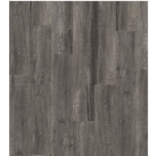
Southern Heritage 263772