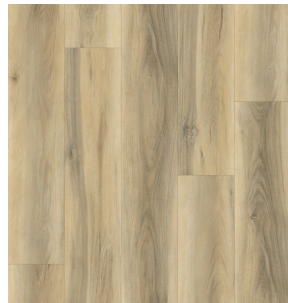
Tassie Pecan 294647