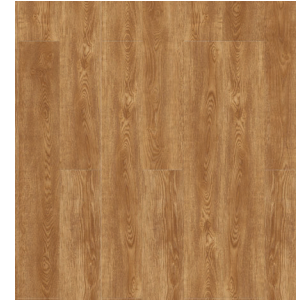
Hampton Oak 263773