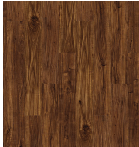
Queensland Acacia 289039