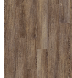
Sherwood Oak 263770