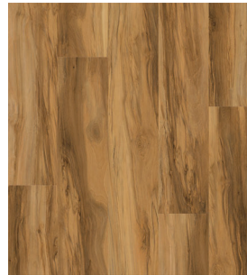
Rum River Hickory 294646