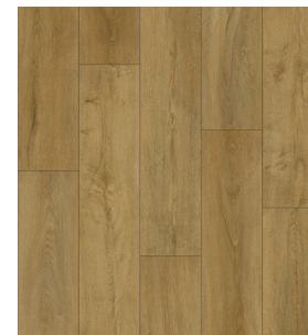
Wadsworth Oak 294648