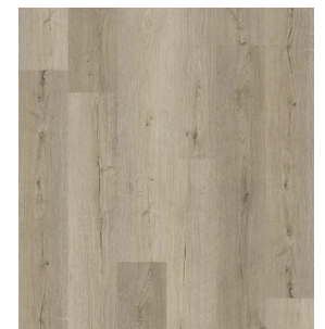
Willow River Oak 289037