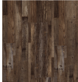
Cottage Plank 297809