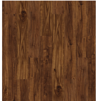
Queensland Acacia 297801