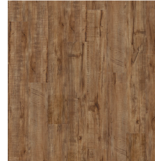
Estate Oak 297805