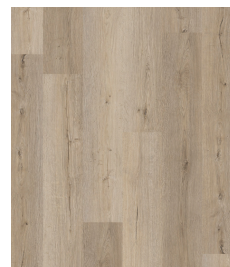
Willow River Oak

Virgin PVC (Ortho-Phthalate free) Enhanced high durability wear layer Premium glue down installation UV cured with ceramic bead for added scuff resistance Nano-Silver coating (antimicrobial) Perfect for schools, clinics, restaurants, shops and hotels Hygienic, easy to clean, scuff and stain resistant