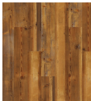
Vintage Pine 297806