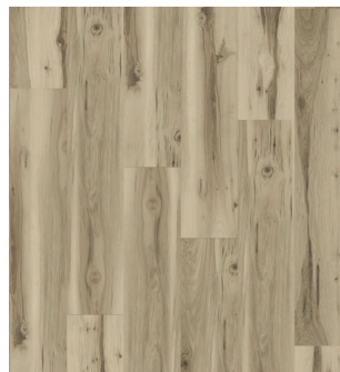
Toasted Hickory 297942