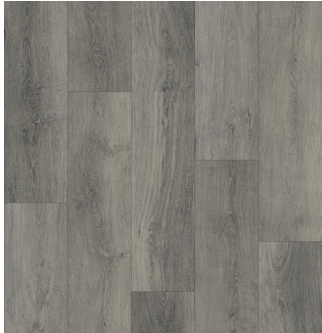
Afton Oak 297808