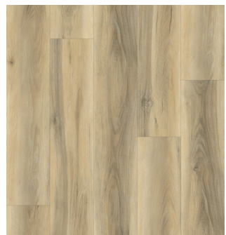
Tassie Pecan 297810